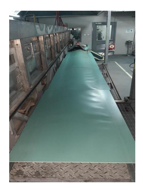
Photo 4: Specimen after the test. (Fire side from the exhaust end)